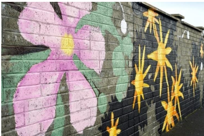
By Bríd Ní Luasaigh