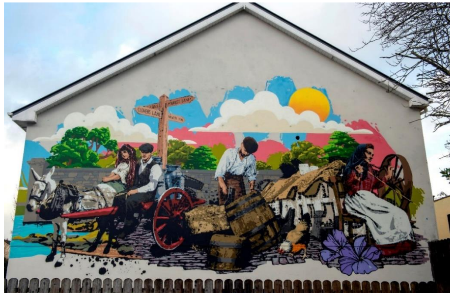
By Don MacMonagle