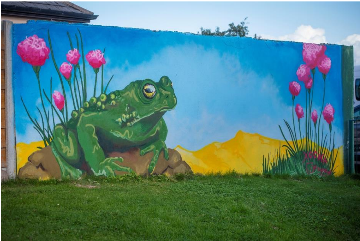
By Domnick Walsh

Budget: €8,000 (total for two murals at Castlegregory Playground & Maharees Pier & for a natural heritage project)